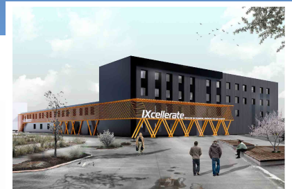
IXcellerate Moscow Two conceptual image