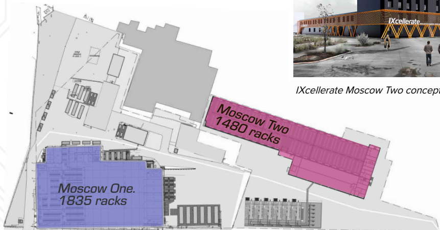
IXcellerate campus with two data centers and engineering infrastructure